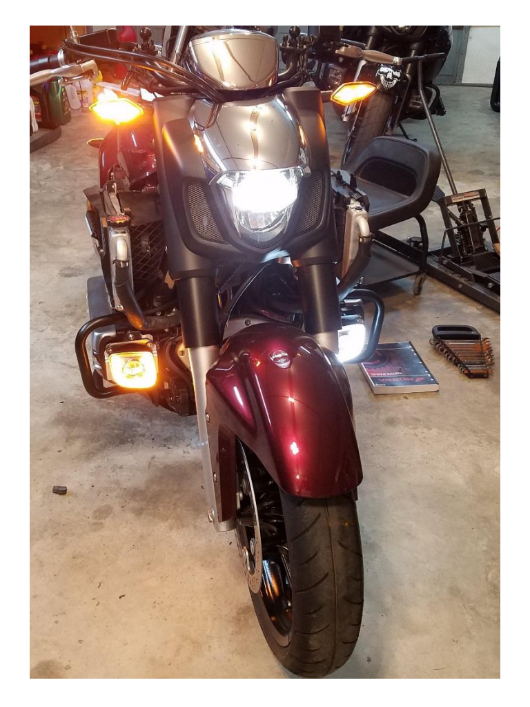
STEP 7: Reinstall any components that were removed for wire access. Reinstall seat.