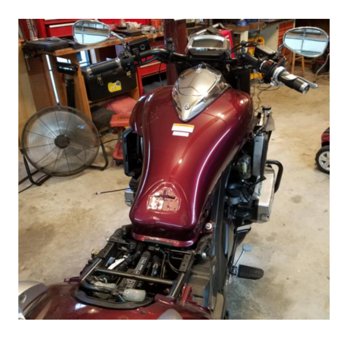
STEP 2 : Locate the POST ECU wiring harness bundle. Carefully remove the wire tape surrounding the wire bundle.