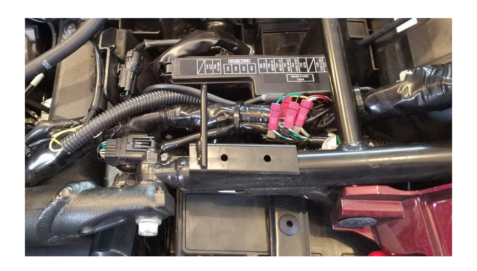
STEP 5 : Secure all connectors and AdMore adapter at installer's discretion. Example photo: