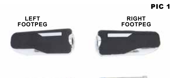
5/16-18 X 3-1/4 SHCS